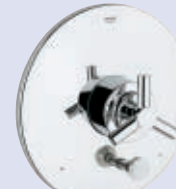
19 490 GROHE Allure chrome only