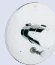
19 492 Atrio 000, BE0, EN0