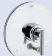
19 491 Atrio 000, BE0, EN0