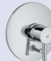
19 493 Tenso 000, EN0